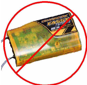
NO OrangeRx Receivers

These are NOT approved by the MAAA and any incident caused by their use might not be covered by MAAA Insurance . Accordingly, they are NOT permitted at DAC .