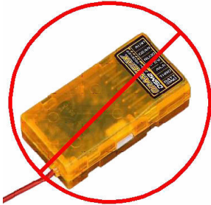
NO OrangeRx Receivers

For the attention of all DAC members (and their visitors)